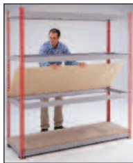
...with framework complete, stockrax put the shelves into position.