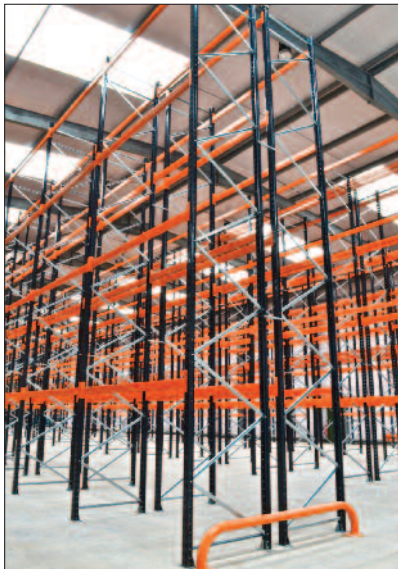
We have a wide range of pallet racking solutions to meet your operational needs, whatever your warehouse size.

Whatever your needs, contact your local distributor today on and they will make solving your storage problems a lot easier!