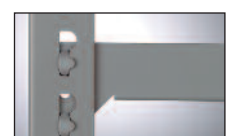
Light Grey Uprights (GU)