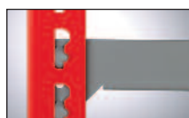
Red Uprights (RD)

Choice of 4 upright colours with Light Grey beams