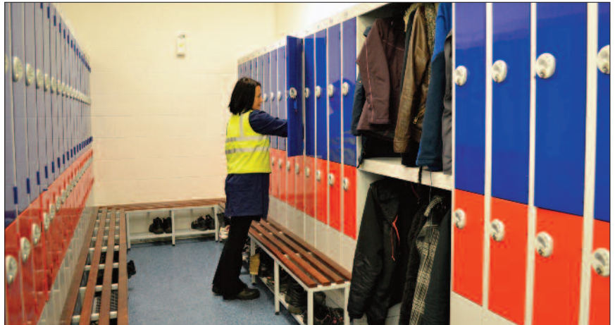
Our steel lockers are available in a wide range of sizes, door configurations, locking options, colours and finishes ensuring staff belongings are safe and secure.