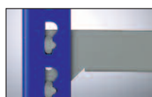
Blue Uprights (GB)