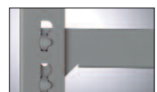
Light Grey Uprights (GU)