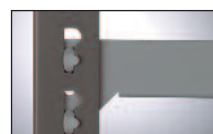
Dark Grey Uprights (GX)