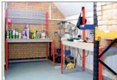
A range of packing and maintenance benches for use throughout production and warehousing operations.