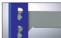
Blue Uprights (GB)