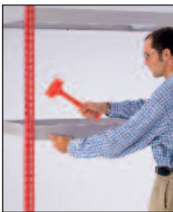
Unpack and assemble framework by simply tapping together...