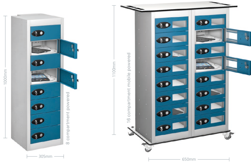
Charging External Depth 370mm

charge and store smaller devices such as phones, tablets, body cams etc.