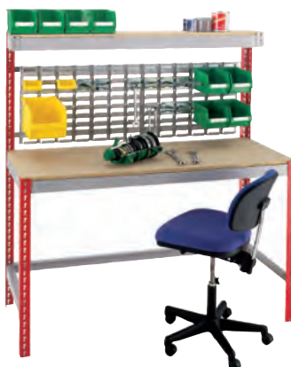
Stockrax self assembly workbenches. See pages 126-127