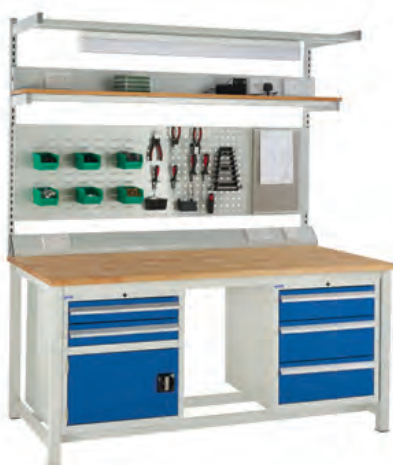
Everyday general use medium duty workbenches. See page 128