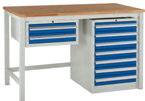
Euroslide modular bench and drawer system. See page 134

Standard and heavy duty workbenches for use in production, manufacturing and warehousing across a wide range of industrial sectors.