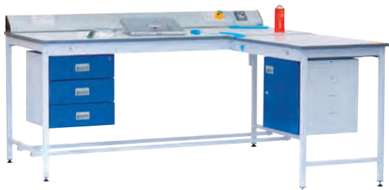
Electro Static Dissipative benches for use in static sensitive areas. See page 130