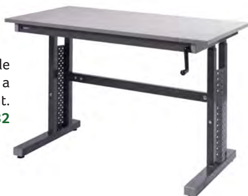
Height adjustable workbenches for a flexible working height. See page 132