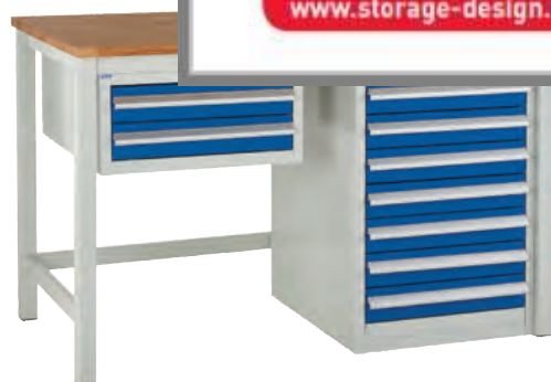
Euroslide modular bench and drawer system. See page 134