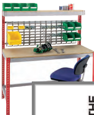
Stockrax self assembly workbenches. See pages 126-127

Standard and heavy duty workbenches for use in production, manufacturing and warehousing across a wide range of industrial