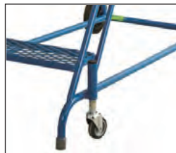
Spring loaded wheel castors