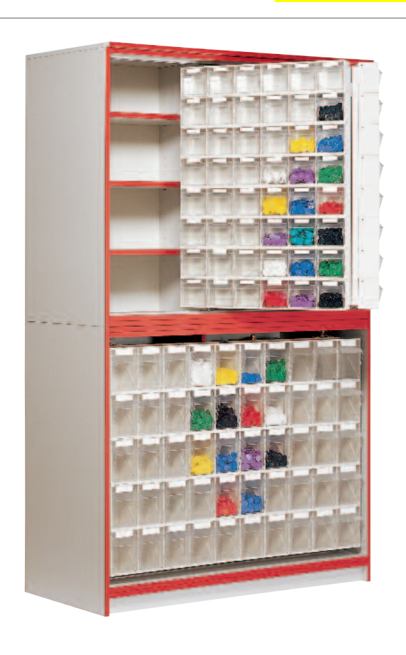
FS CH 146