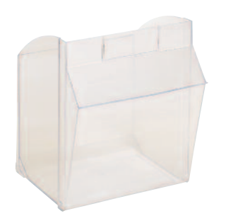
ST B 2

Inside dim.: 100 x 108 /97 Volume: 1,05 I