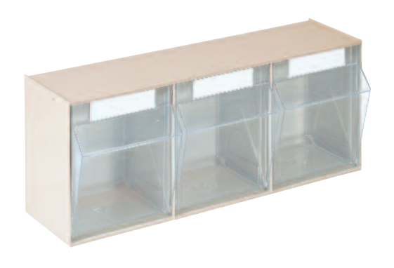
ST S 3