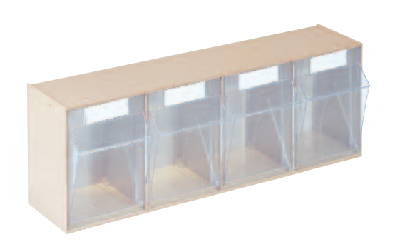
ST S 4