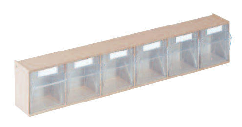
ST S 6