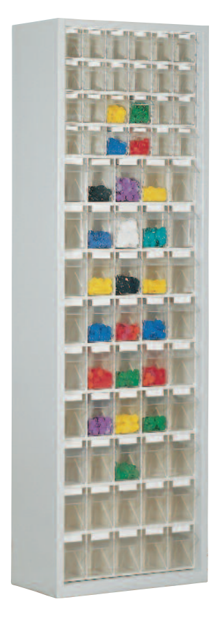
ST P 69