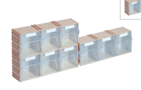
ST S 3/6