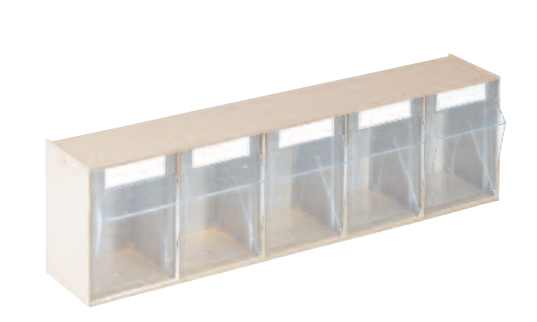
ST S 5