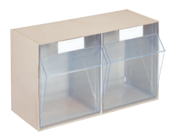
ST S 2