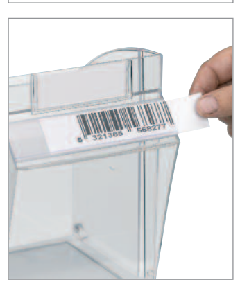
Self-adhesive label bar