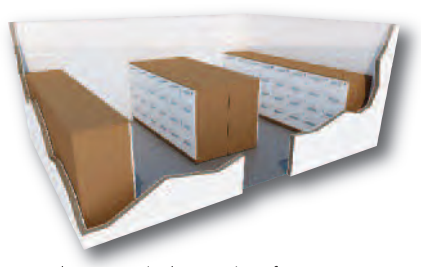
Based on a nominal room size of 5.5 x 4 metres, 32 four drawer filing cabinets would provide approximately 76 linear metres of filing