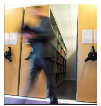
Mobile shelving offers a high density storage solution, making ideal for offices where space is at a premium.

Design + Supply + Installation by : STORAGE DESIGN LIMITED Primrose Hill, Cowbridge South Wales, CF71 7DU Tel: 01446 772614 Fax: 01446 774770 web: www.storage-design.ltd.uk email: info@storage-design.ltd.uk