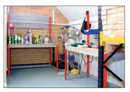
A range of packing and maintenance benches for use throughout production and warehousing operations.

Whatever your needs, contact us today on 0800 169 5151 and we will help solving your storage problems a lot easier!